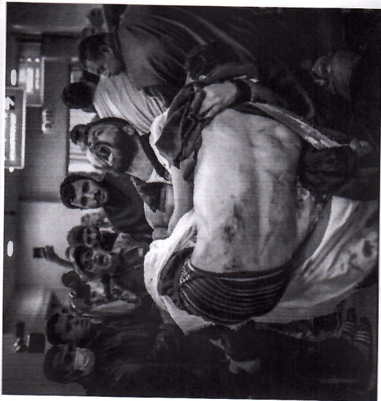
The Martyrs and wounded of Khan Younis.

The original 1988 Hamas charter is functionally a manifesto. It outlines their beliefs on Palestinian land belonging to the Palestinian people, their beliefs on the place of Islam on the Palestinian land, and their willingness to use violence to achieve these means. This document was highly criticized for the presence of anti-Jewish rhetoric— which was undeniably present.