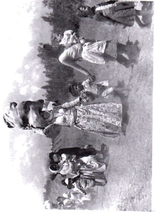
The 1948 Nakba

The military ruler of our town later explained: it was necessary for law and order,