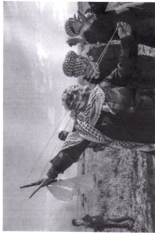
Woman with slingshot at the Great March of Return, Gaza

Via The Covenant of the Islamic Resistance Movement; Gaza Fights For Freedom